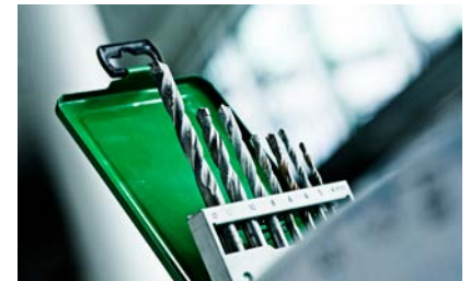
Drilling and milling technology