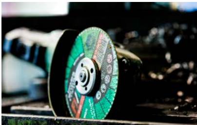
Cutting and grinding – Diamond technology